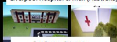
Liverpool Hospital & Mall (Australia)