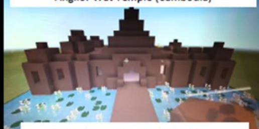
Angkor Wat Temple (Cambodia)