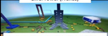
Eiffel Tower (France)